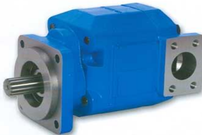
360 SERIES HIGH PRESSURE GEAR PUMPS