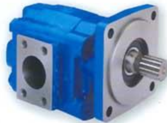
5100 SERIES GEAR MOTORS