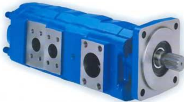
5100 5100 SERIES MULTIPLE GEAR PUMPS