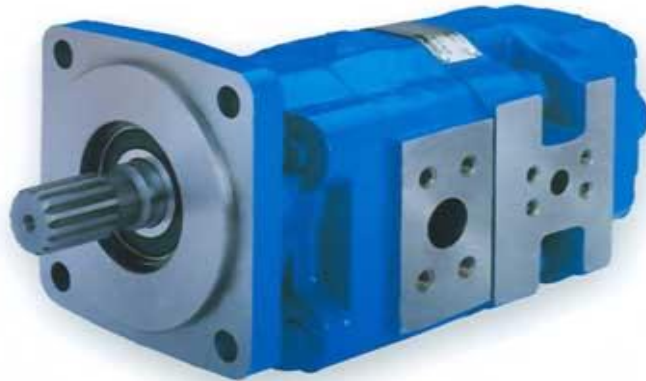
5100/124 SERIES TANDEM GEAR PUMPS